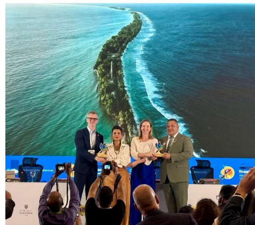
Santa Marta Process Begins

Much has happened in the climate civil society space. The First Conference for a Just Transition away from Fossil Fuels was held in Santa Marta, Colombia in late April and was cause for renewed hope among climate justice advocates. The conference, co-hosted by Colombia and Norway, was attended by 57 countries, including Canada, who are willing to engage in developing a transition away from fossil fuels. This conference arose from discussion among members of the Fossil Fuel Treaty and was preceded by a People's Summit and the release of the People's Declaration for a Rapid, Equitable, and Just Transition for a Fossil-Free Future , the outcome of months of work by civil society organizations, frontline communities, Indigenous Peoples, and others. The