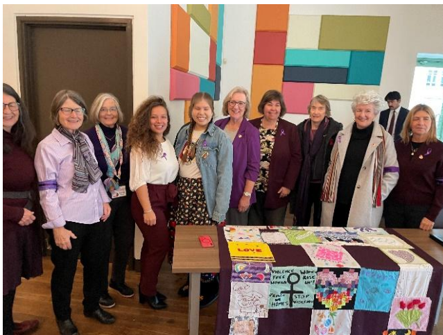
GRANs and partners met at Ottawa City Hall for the Mayor's Declaration of #16 Days.