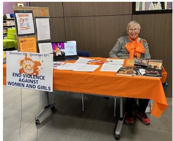
Info table at Brighton Public Library set up by GRAN Northumberland