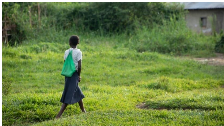
A girl makes the long journey to school in Kailo village near Kindu, Maniema province, DRC.

This article from the World Education Blog explores this problem in several African countries. Using examples from the DRC, Uganda, and Tanzania, the article shows that passing a law is only the beginning. The real work lies in consistent enforcement and challenging the societal attitudes that stand in the way of progress. Excluding pregnant adolescents from school is not a solution; it is a social and economic stain that perpetuates a cycle of poverty, stigma, and violence. Ultimately, allowing a pregnant girl to remain in the classroom is not just an act of mercy; it is a strategic investment in the future. To learn more, click here .