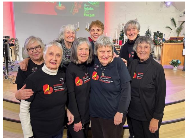
Victoria GRANs attend December 6 th Memorial Service