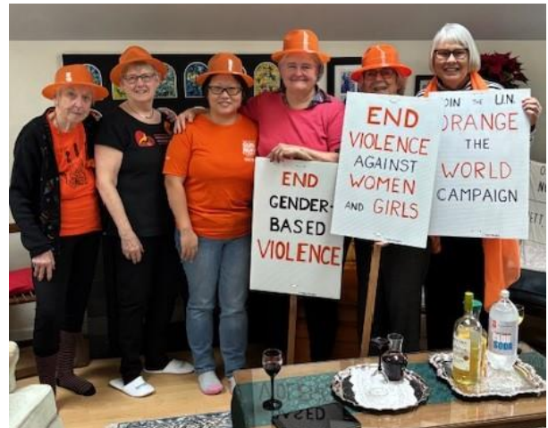
Greater Vancouver GRANs host Orange the World lunch.