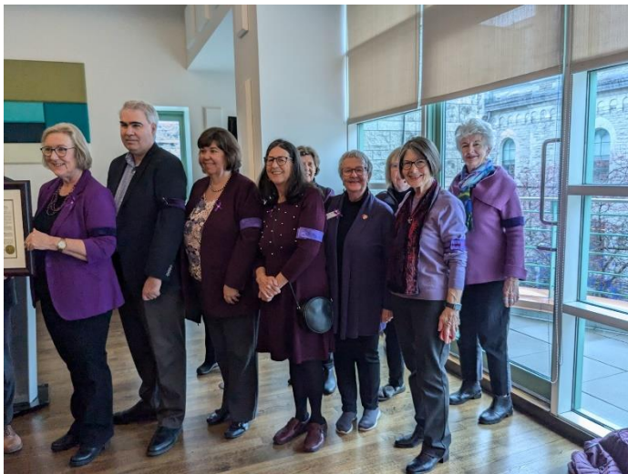
Ottawa Gatineau GRANs at Mayor's Proclamation on Gender-Based Violence