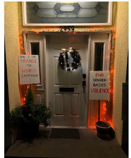
A Greater Vancouver GRAN "oranged" her own front door!