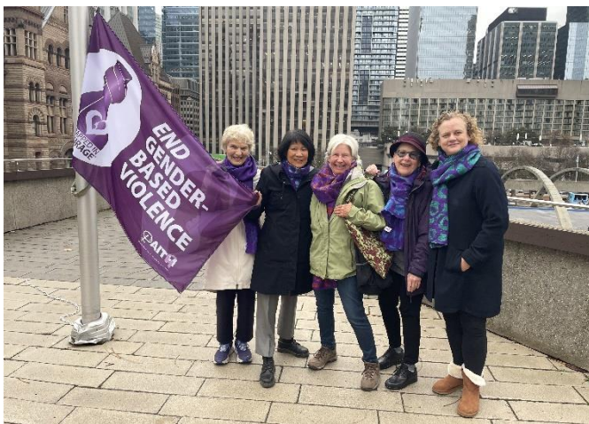
GTA GRANs at flag raising at Toronto City Hall, with Mayor Olivia Chow

In the months of November and December, GRANs worked in their communities to raise awareness and build support for action on gender-based violence. Thank you to all GRANs who sent in pictures! The photos below show the results of much hard work, strong partnerships, and local connections. Check out the Orange Campaign Photo Gallery on our website for more.