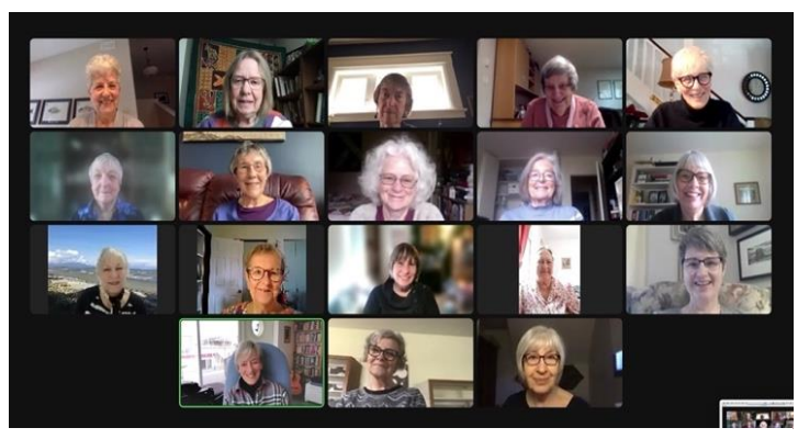
Members of GRAN's Right to Food Design and Consultation Teams

Leadership for the campaign has been provided by a group of twenty GRANs from across the country, comprising representatives from Watch Groups, regional GRAN groups, and individual GRAN volunteers. The nine-member Design Team is charged with developing the advocacy plan and campaign resources, building partnerships, engaging the membership, and organizing learning events. The Consultation Team (eleven members) provides guidance on the focus of the