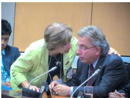
On Parliament Hill

The Hill Team has had a transformative five years, moving from meeting with Ministers in the Conservative government, such as John Baird, to meeting under the Liberals with Global Affairs Canada, through collaboration with other CSOs such as the Interagency Coalition on AIDS and Development (ICAD) and the Africa-Canada Forum. Although the Hill Team continues to meet occasionally with MPs and Parliamentary Secretaries, more of its time is now spent with partner and coalition meetings with Global Affairs Canada and parliamentary associations and committees. The Team also provides advice on parliamentary strategy to the Working Groups.