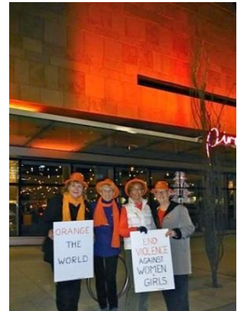
Orange Campaign Event

The Working Group on ending violence against women and girls began by focusing on two issues: violence in mining settings and child marriage. The mining issue became a campaign about conflict minerals focused on supporting Bill C-486, the Conflict Minerals Act. Although the bill was not passed, the campaign was very successful in raising awareness about the use of conflict minerals, particularly in electronic devices. The focus on child marriage led to the development of a policy paper on Child Early and Forced Marriage (CEFM) and the initiation of a new partnership with the global organization Girls Not Brides. Our work in ending violence against women and girls also led us to a new partnership with the Women, Peace and Security Network-Canada.