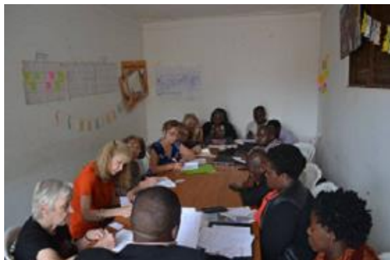
GRANs meet Ugandan Advocacy Organizations

Five years have come and gone since GRAN held its first Hello Friends conference in June 2013. During that time the Millennial Development Goals (MDGs) transformed into the Sustainable Development Goals (SDGs), the Conservative Harper years were replaced with the Liberal Trudeau years, and GRAN supported calls to action both on the global stage and at home. Together we have celebrated many milestones and weathered many challenges, bringing us to where we stand today – a vibrant national advocacy organization that has made a difference on a number of fronts.