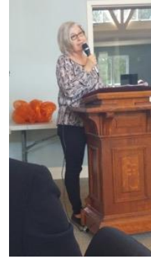
GRAN Conference Brighton, Ontario

There were regional gatherings, African films, speakers, and other activities which were above and beyond specific advocacy campaigns, but which brought GRANs together in the cause for African grandmothers. The vibrant Ottawa Regional group meets quarterly to share and educate and is central to organizing all the logistics surrounding the Hello Friends event.